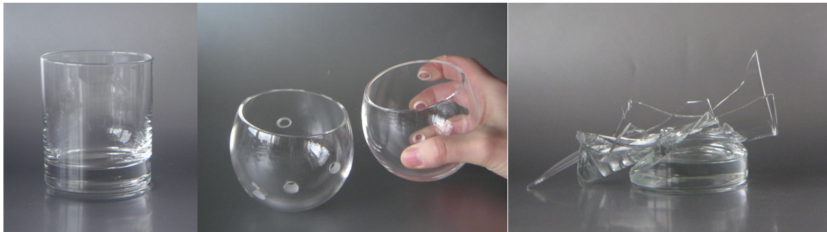
Figure 2: Designing as analytical tool

The outcome of the designing for the research process was a record of the design process which provided important knowledge of the relationship of function and interaction, and about creating awareness of this interaction. In this way, the analysis through designing made a contribution to the conceptual understanding of function and its translation into artefacts with particular functional characteristics. The study thus provided insights into the potential and the limits of using function within design. This knowledge also helped develop some tentative design guidelines as a contribution to design practice.