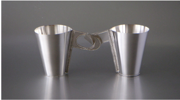
Fig. 3: Jointing of Argentium Sterling Silver

In both examples of using designing as creative exploration within research, designing has been used within a predetermined research framework, within which the creative aspect of designing has been brought to bear. This way of using designing within research is therefore not illustration or demonstration, nor is it necessarily about testing any concept or theory, but essentially it utilises designing to reveal new avenues and opportunities for development, and to gain new insights and understanding.